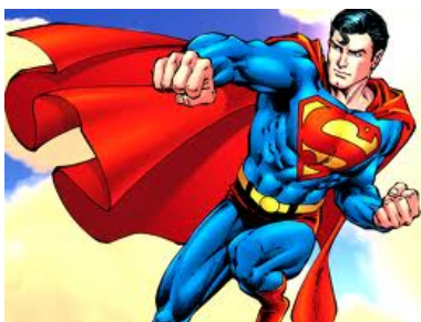
Superman gg, ff, SS, BB